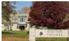
Rhode Island College