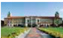
Texas Tech University