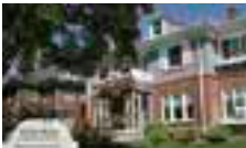
Idaho State University