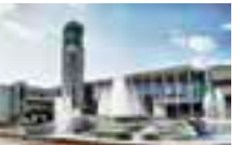
Missouri State University