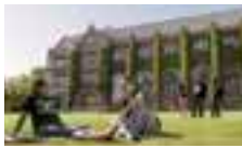
University of Idaho