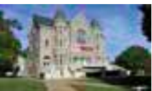
Virginia Union University