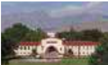
New Mexico State University