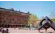
Western Washington University

These universities grant academic credit to students enrolled at them and can also grant transfer academic credit to students from other colleges who apply to the KCP program through them.