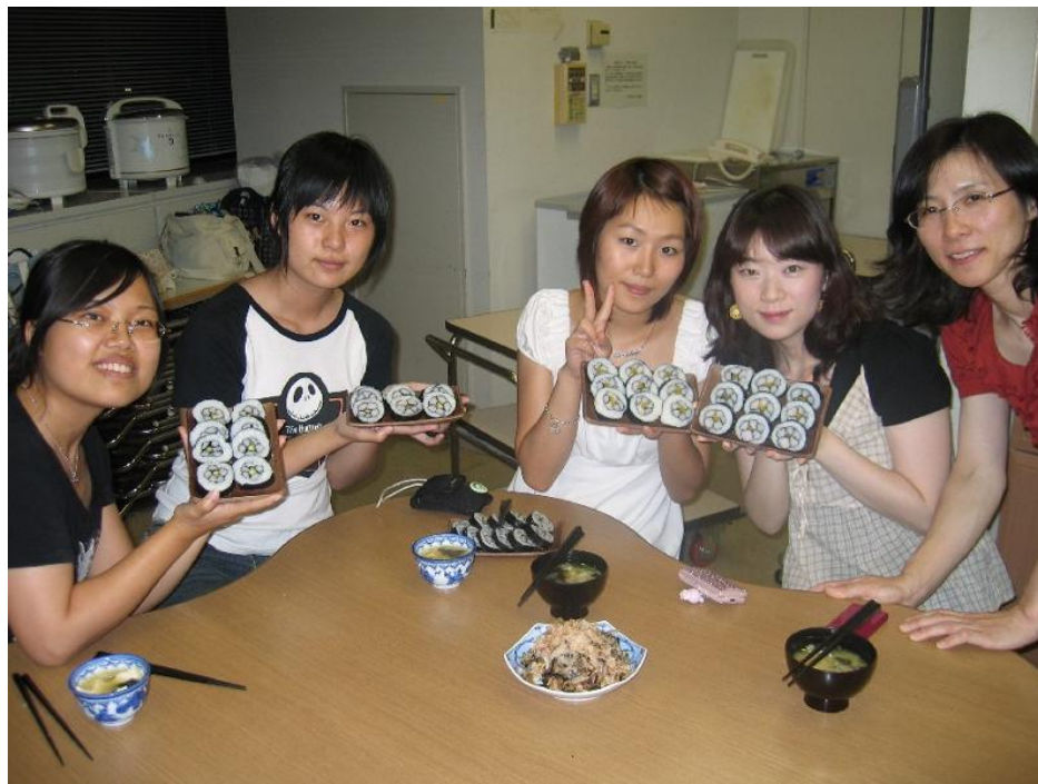
Cooking class: yummy norimaki (sushi rice and seafood).